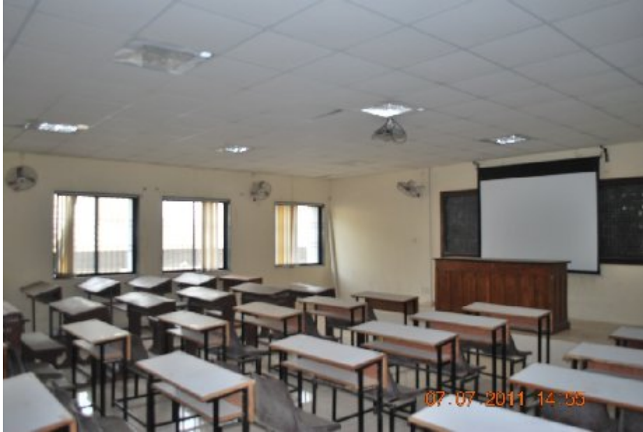
Class Room 13