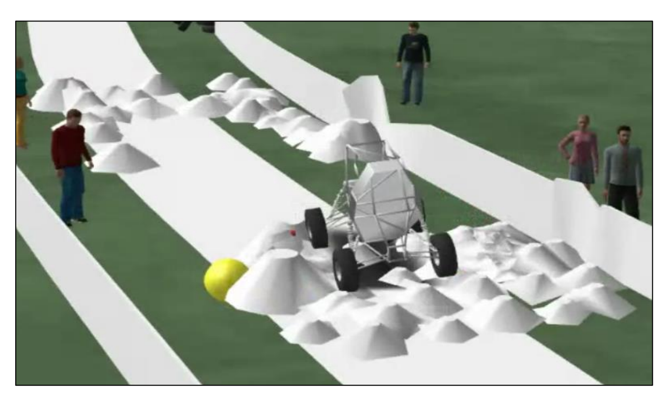
Dynamic Simulation in IPG Carmaker – Rock Crawl