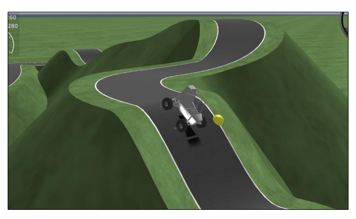
Dynamic Simulation in IPG Carmaker – Stiff Jump while turning